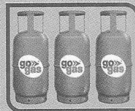
Packed Cylinder Marketing